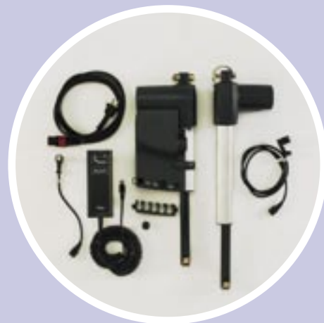
Motors with cables that disconnect easily, for ease of maintenance and cleaning.