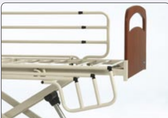
Foldable side rails For patient safety.