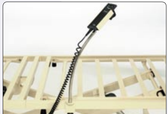
Hand control support.