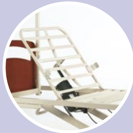
Electric adjustable head-end has an incline up to 72°.