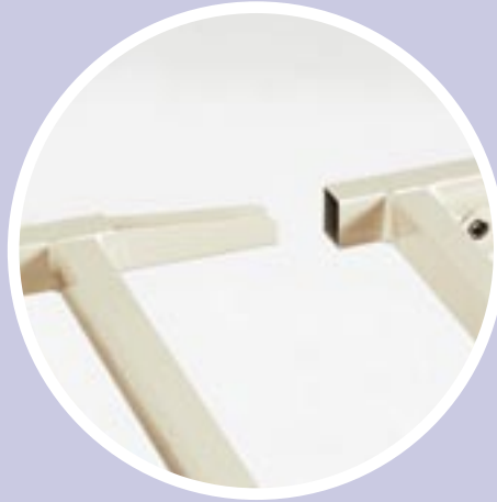
Interlocking base unit.