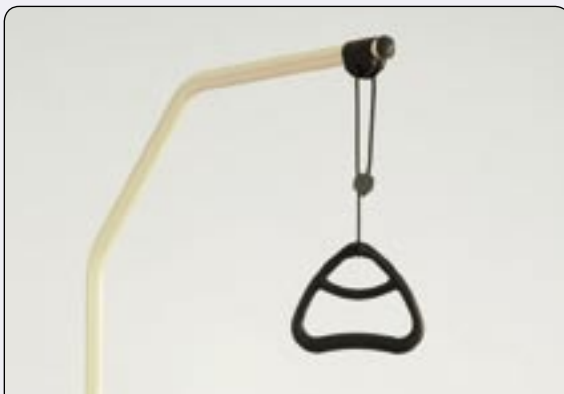
Lifting pole, epoxy coated steel, can be positioned on left or right side.

Available in 'Low Risk' to 'Very High Risk' categories. (Please see Invacare ® Home Care Catalogue for details)