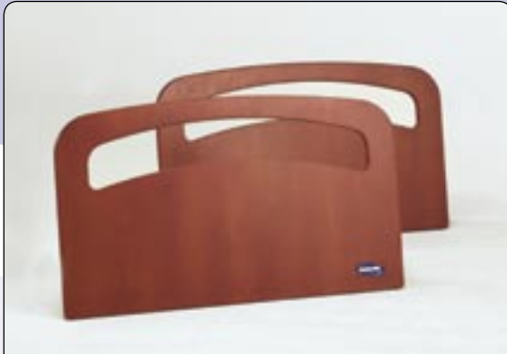
Beech or Cherry wood finish bed ends