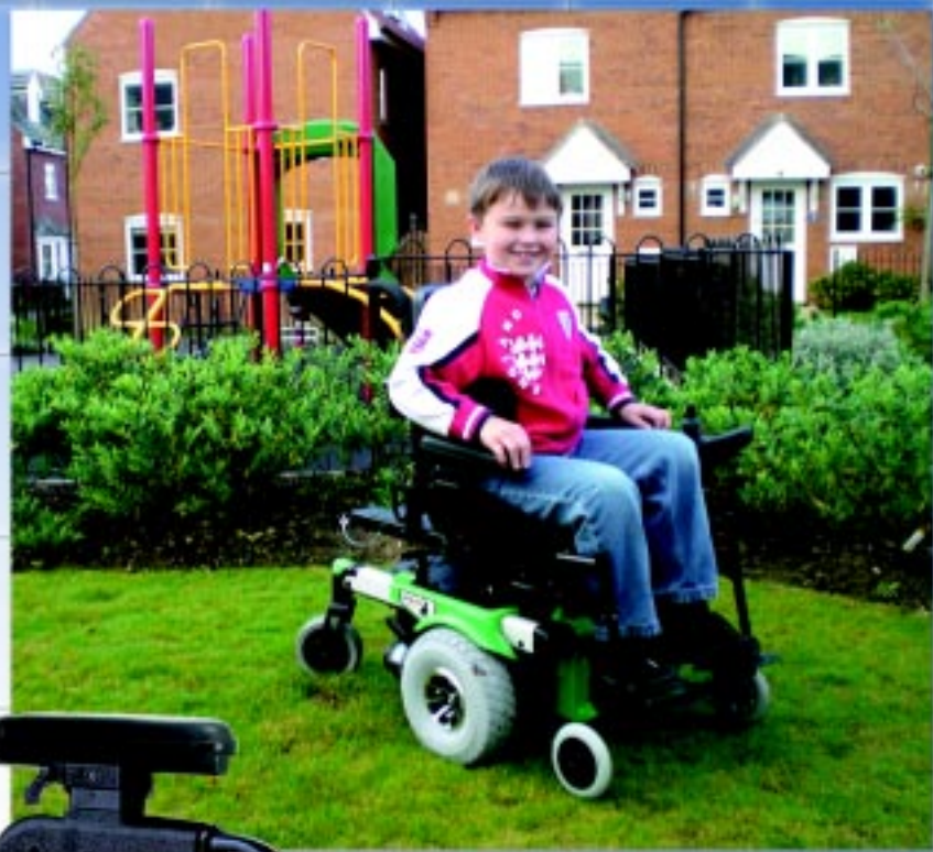
Quantum ® 1107 Shown in Red with Synergy ® seat, swing-away legrests and VSI controller

More Advanced Features, Excellent Performance & Super Portability. The Quantum ® 1107 brings the most advanced achievements of our engineering efforts together in one compact yet superbly balanced package that conveniently disassembles for transport. Direct connect components eliminate wiring harnesses and provide clean style, unquestionable convenience, and quick and easy disassembly.