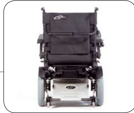
Salsa 12" rear wheel option = 23" (58cm) chair width

Innovative compact base = excellent INDOOR mobility + OUTDOOR freedom