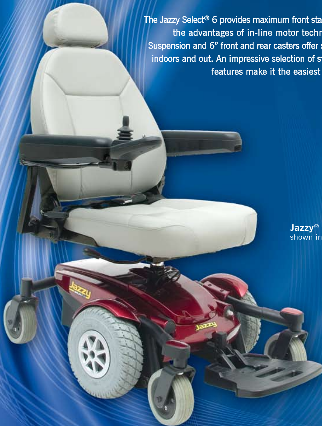
Jazzy ® Select ™ 6 shown in Red

The Jazzy Select ® 6 provides maximum front stability, combined with the advantages of in-line motor technology. Active-Trac ® Suspension and 6" front and rear casters offer superior performance indoors and out. An impressive selection of standard convenience features make it the easiest power chair to use.